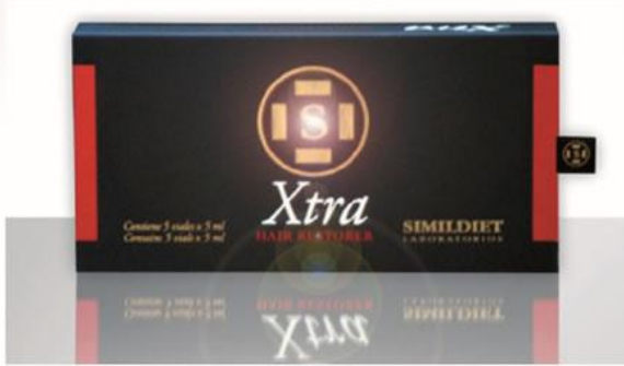
Box contains 5 vials x 5 ml.

They are structurally identical to those found in human skin which means they can intervene in physiological mechanisms with a highly specific overall action.